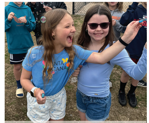
Elementary school students participated in Blowing Bubbles for Autism, an event focused on inclusion, understanding, and celebrating neurodiversity. The bubbles symbolize connection through a simple, joyful activity that all individuals can share, reinforcing a sense of unity and belonging.