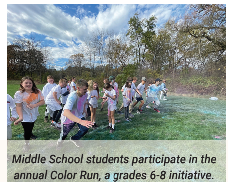
Middle School students participate in the annual Color Run, a grades 6-8 initiative.