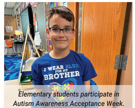
Elementary students participate in Autism Awareness Acceptance Week.