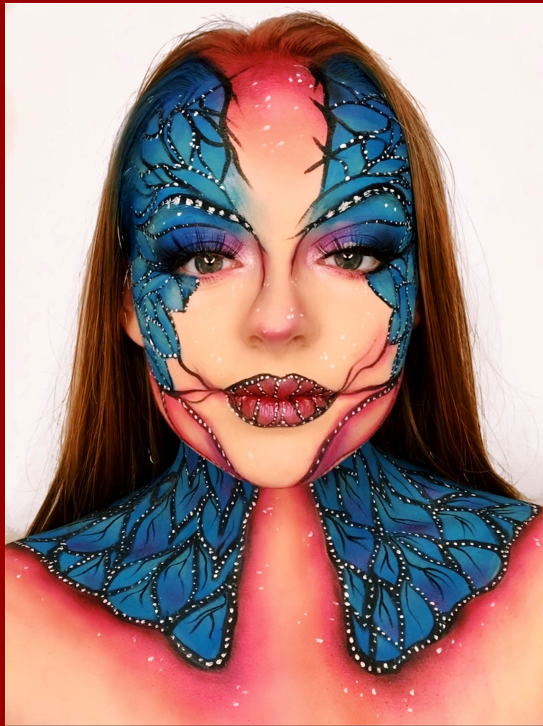
Butterfly Inspired by Sandra Sif