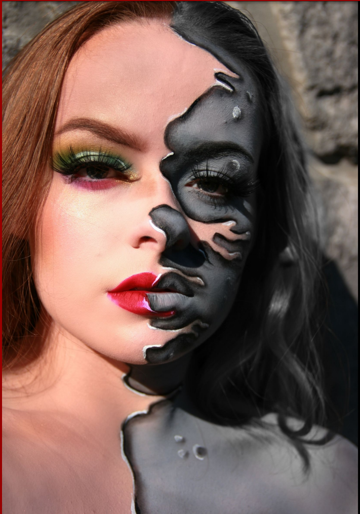
Melting Face Inspired by LaviedunPrince