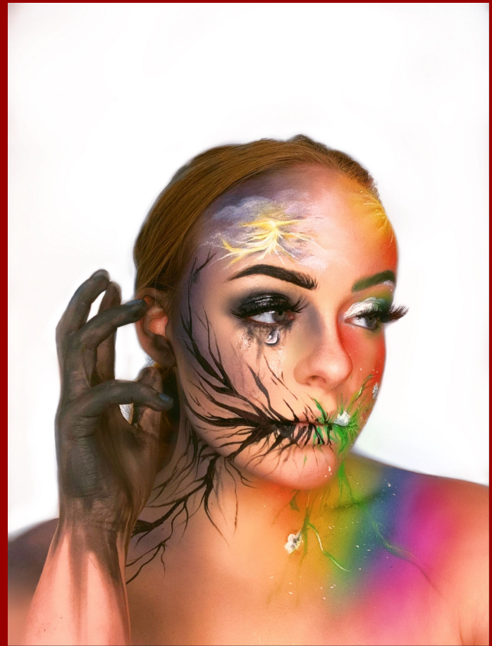
Hope & Despair. Inspired by artist Sandro Botticelli