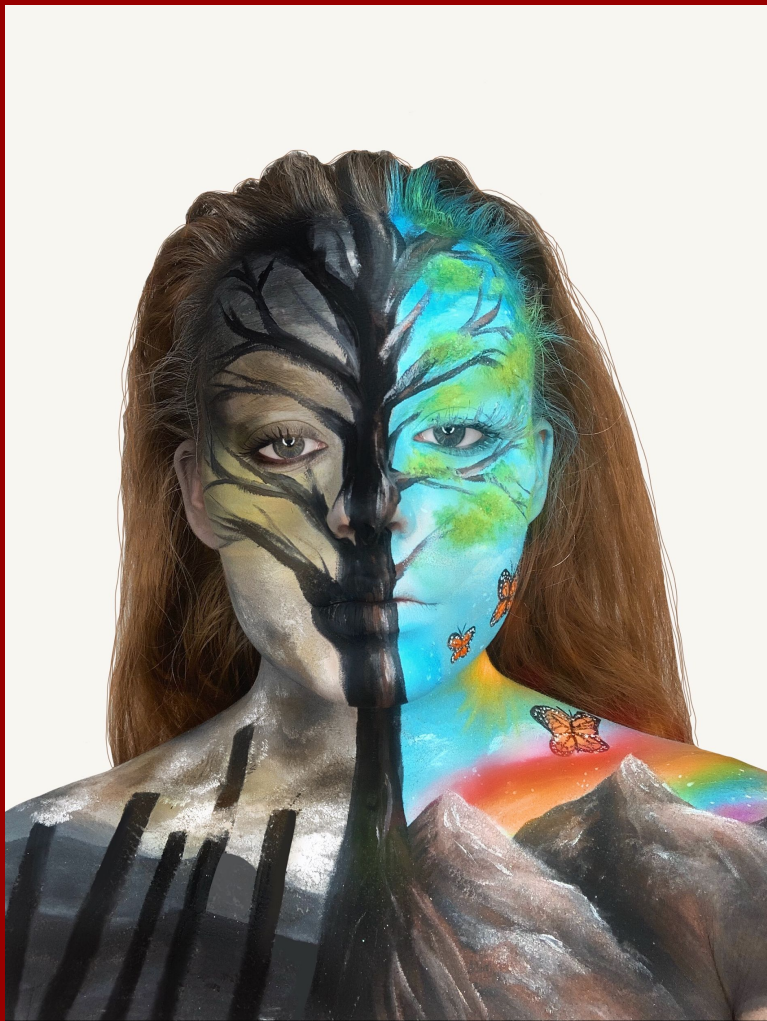
Narrative Photo Healing Earth